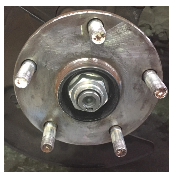
Figure 2 A cleaned hub face ready for fitting.

Failure to follow good industry practice of properly cleaning the hub and rotor surfaces is the most common cause for rotor run out resulting in DTV and brake shudder.