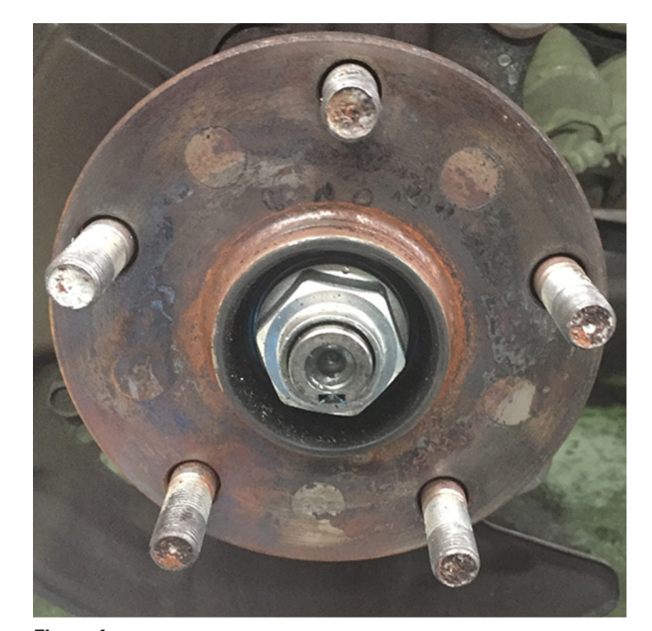
Figure 1 Hub showing built up rust and scale.

Below are some examples of a hub and disc rotor improperly cleaned. All resulted in brake shudder.